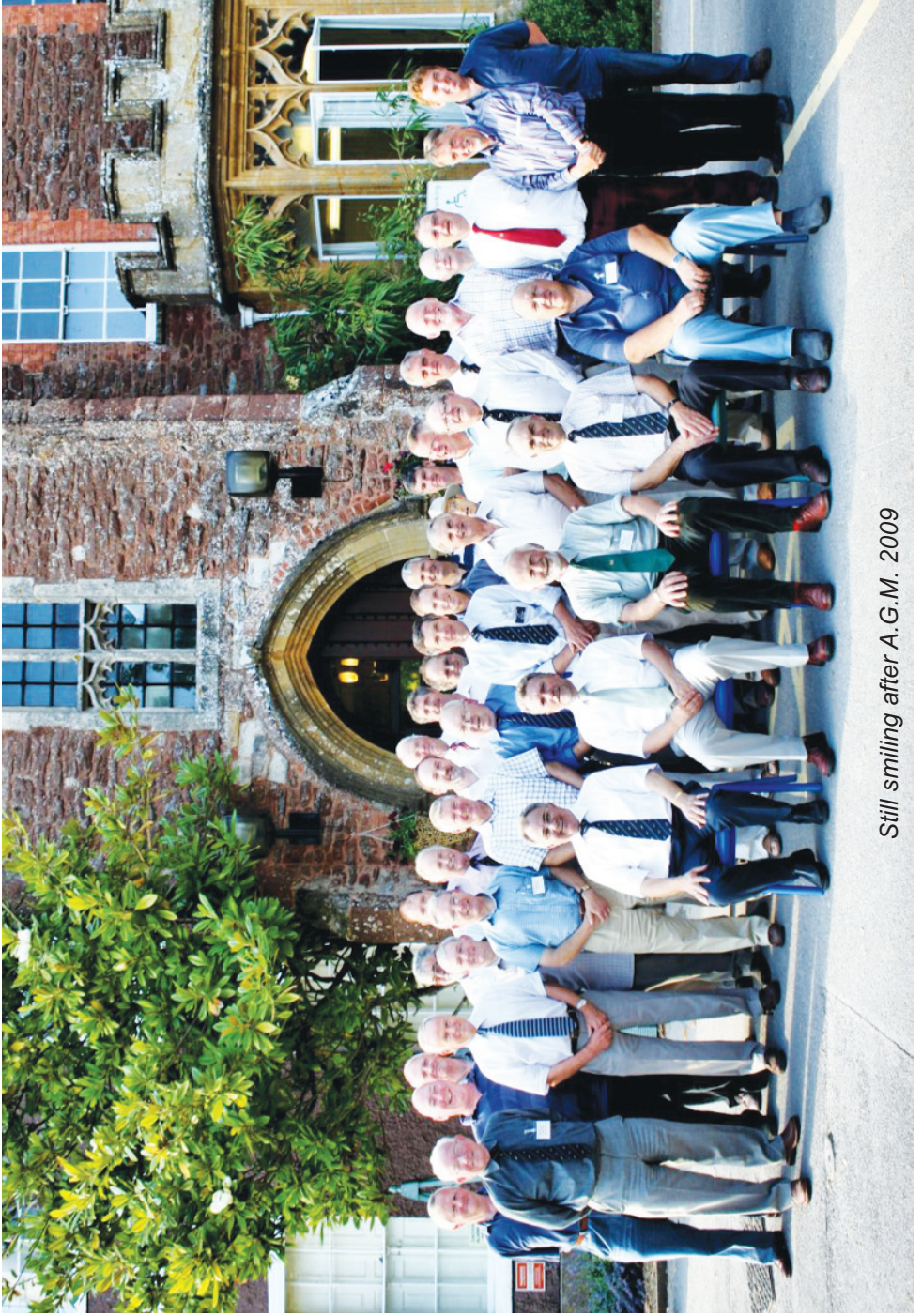
Still smiling after A.G.M. 2009