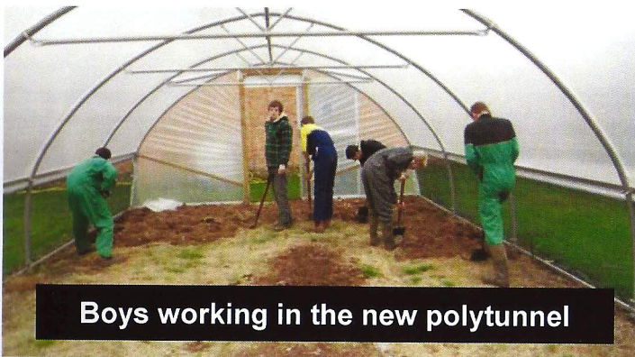
Boys working in the new polytunnel